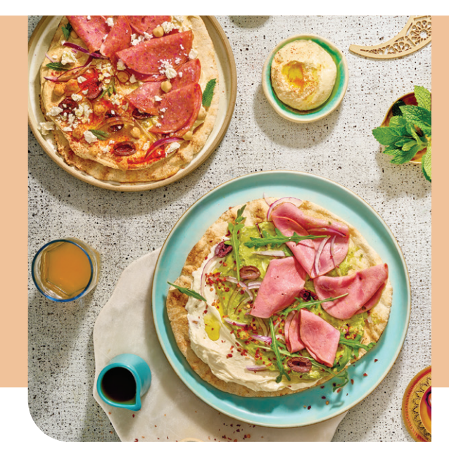
NO ARTIFICIAL FLAVOURS